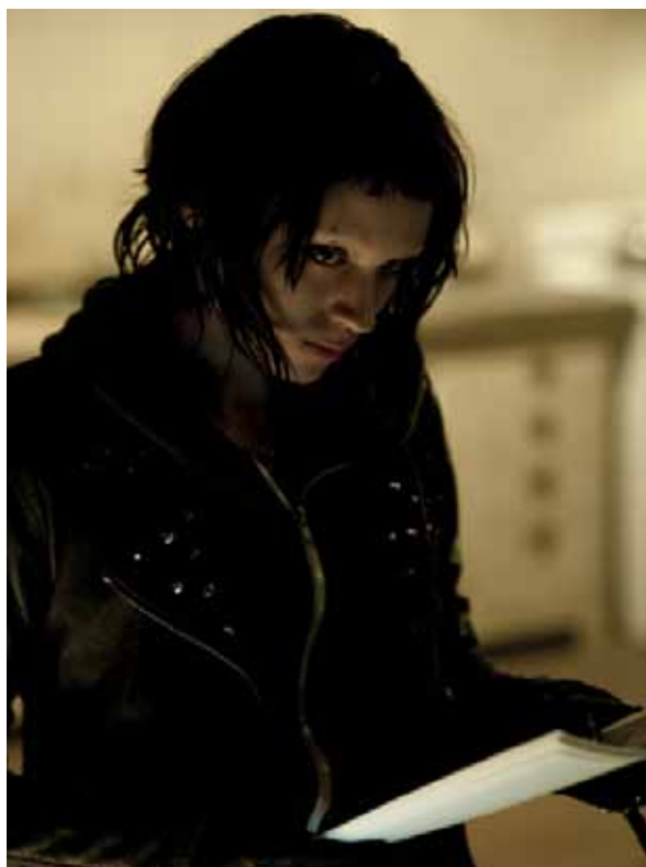
Noomi 'Replaced': Rooney Mara's take on Lisbeth Salander. Or, as director David Fincher sees her, "the Goth Pippi Longstocking".

insistence it remain in Sweden, right up to Sony chiefs Michael Lynton and Amy Pascal. "When Lynton was first telling me the story, I was like, 'I don't know.'" Fincher shakes his head. "The