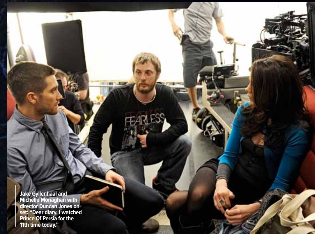
Jake Gyllenhaal and Michelle Monaghan with director Duncan Jones on set: "Dear diary, I watched Prince Of Persia for the 11th time today."

W hat are you going to do with your life? It's a question everyone asks but not everyone can answer. And it can torment you. At the 2010 BAFTA ceremony, one man had his choice validated. Moon director Duncan Jones accepted the award for Outstanding Debut with a speech easily the most touching of the night. "I didn't actually realise how much this meant to me," he said, his voice trembling with emotion. "It has taken me an awful long time to know what I wanted to do with my life, and finally I think I have found what I love doing." On an evening of rather well-rehearsed spontaneity, it was a beautifully unaffected acceptance.