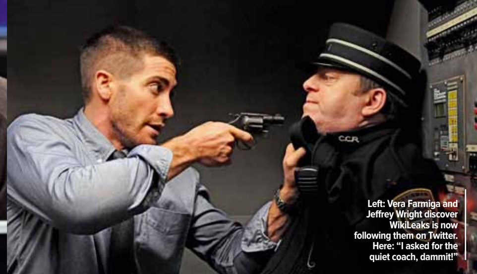
Left: Vera Farmiga and Jeffrey Wright discover WikiLeaks is now following them on Twitter. Here: "I asked for the quiet coach, dammit!"