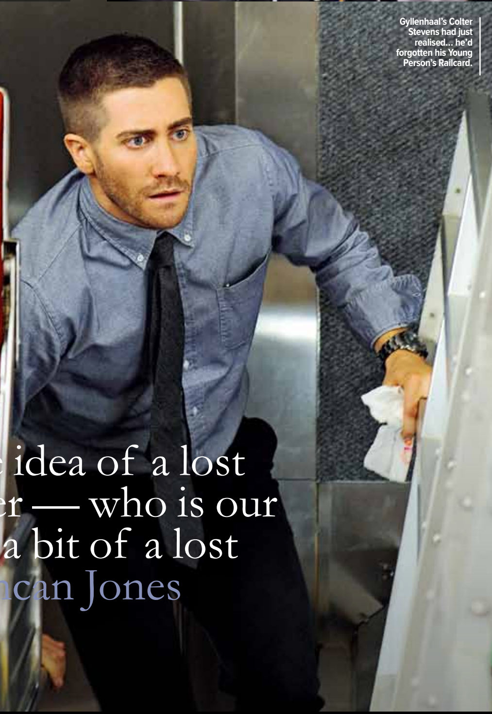
Gyllenhaal's Colter Stevens had just realised... he'd forgotten his Young Person's Railcard.

"I love the idea of a lost soul. Colter — who is our hero — is a bit of a lost soul." Duncan Jones